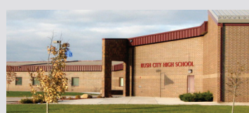
Rush City, Minnesota, and Frederic and Luck,