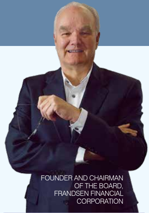
FOUNDER AND CHAIRMAN OF THE BOARD, FRANDSEN FINANCIAL CORPORATION